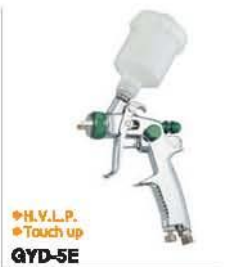
◆H.V.L.P. ◆Touch up GYD-5E