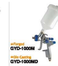
◆Forged GYD-1000M ◆Die Casting GYD-1000MD