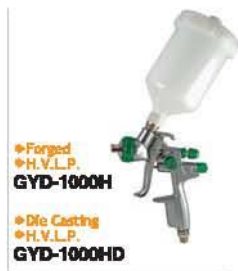
◆Forged ◆H.V.L.P. GYD-1000H ◆Die Casting ◆H.V.L.P. GYD-1000HD