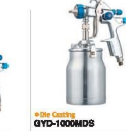
◆Die Casting GYD-1000MDS